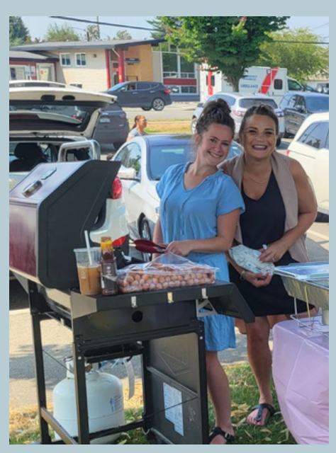
Preparing lunch for 100+ Moms at a Better Beginnings BBQ