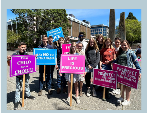
Victoria March for Life 'We are the Pro-Life generation and we will abolish abortion'